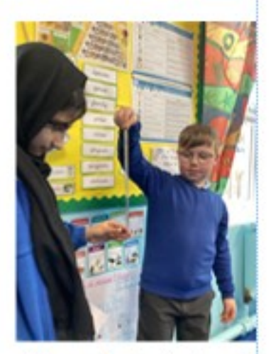
Does your dominant hand react faster than a non dominant hand?